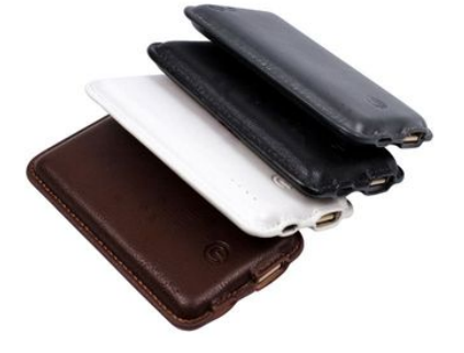
Trinity II Leather Power Bank