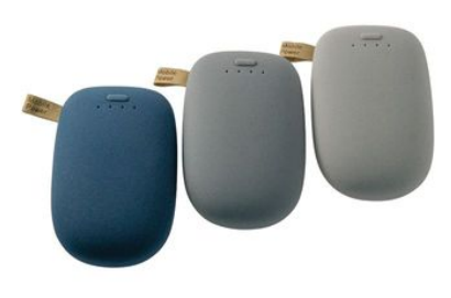
Pebble Power Bank