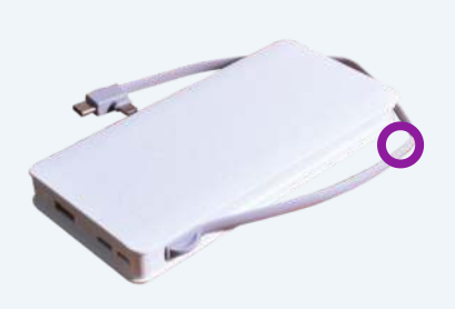
Sabre Eco Wireless Power Bank