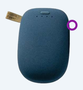
Pebble Power Bank