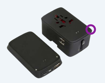
Lazio Travel Adaptor and Power Bank