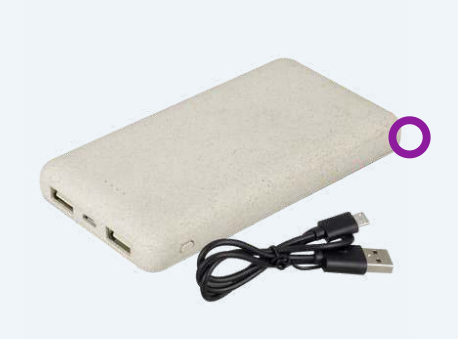
Natura Power Bank 122268