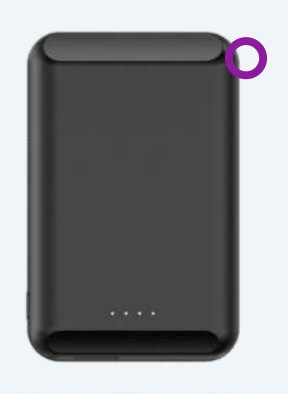
Denver Magnetic Wireless Power Bank