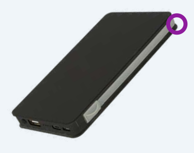
Jarvis 5k Wireless Charging Power Bank