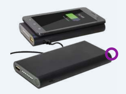
Kronos Wireless Power Bank