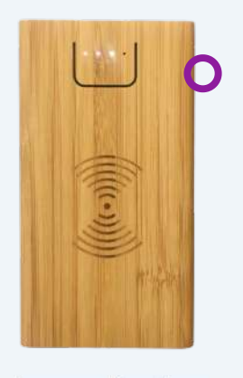
Jaegers Bamboo Wireless Power Bank