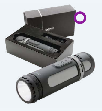
Swiss Peak 4-in-1 Speaker