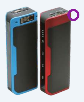
Kal Bluetooth Speaker Power Bank