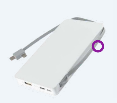
Sabre Wireless Power Bank