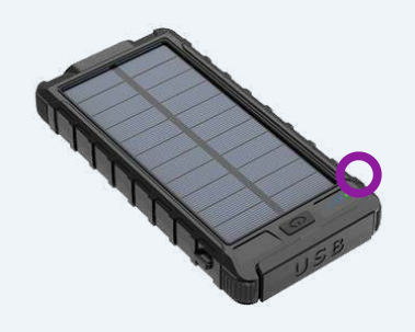
Outback Solar Power Bank (Stock) AR1151s