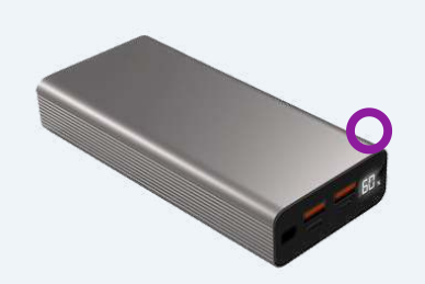
Buster Power Bank 20000 mAh (Stock) AR1152s